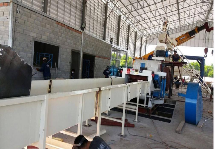
Large Wood Chipper in Thailand