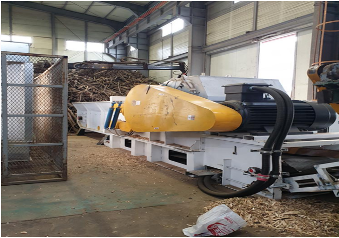
15-25t/h Wood Chipper in South Korean