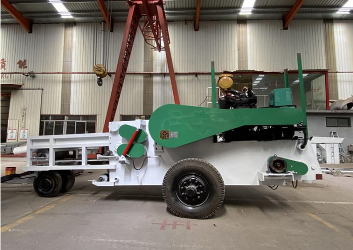
220HP Diesel Wood Chipper in Spain