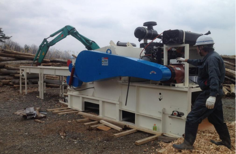
Diesel Wood Chipper in Japan