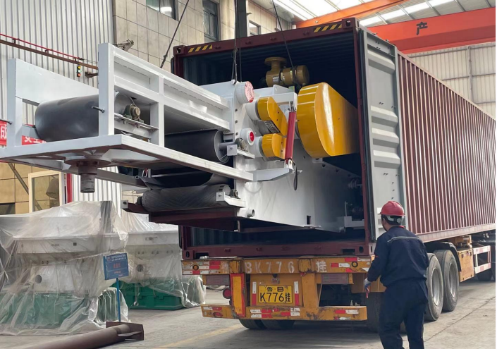
220HP Diesel Wood Chipper in Thailand