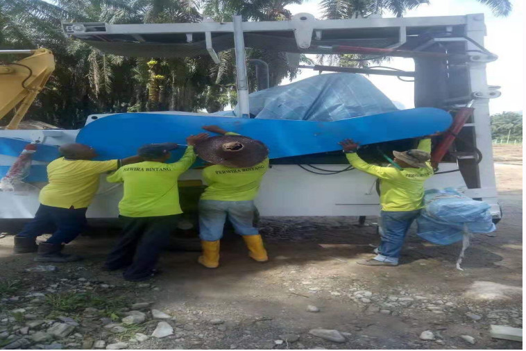
Diesel Wood Chipper in Malaysia